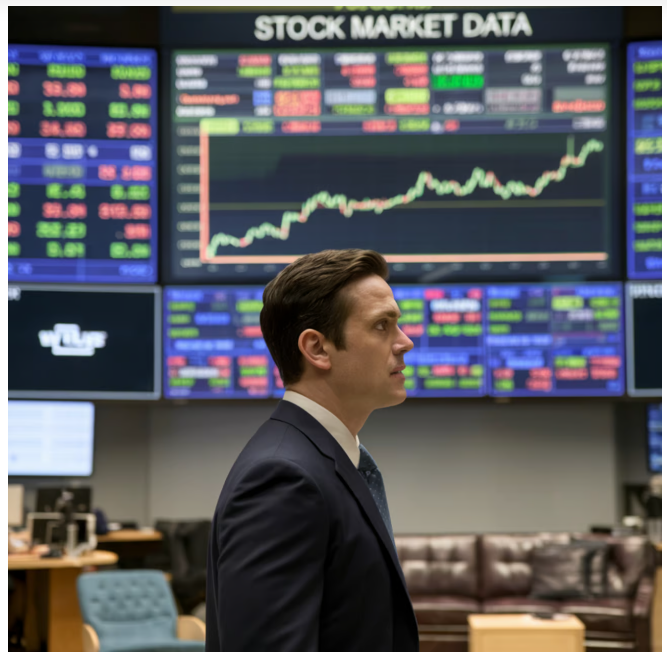
Made with Ideogram i.e. not a real person

Systematica Investments, one of the largest female-led hedge funds, is using AI to create novel datasets, including sentiment analysis of executive and policymaker speeches. The team recently considered investing in a program that evaluates tone of voice, per Bloomberg.